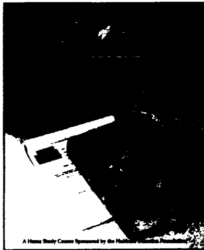
A Home Study Course Sponsored by the Hubbard Dianetics Foundation