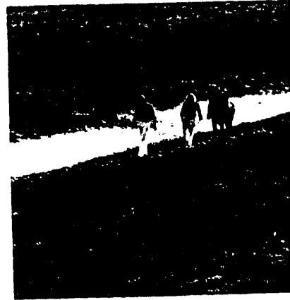
5 temperate: not going to extremes, not overdoing things, controlling one's cravings

2-1. Do not take harmful drugs. People who take drugs do not always see the real world in front of them. They are not really there . On a highway, in casual contact, in a home, they can be very dangerous to you. People mistakenly believe they "feel better" or "act better" or are "only happy" when on drugs.