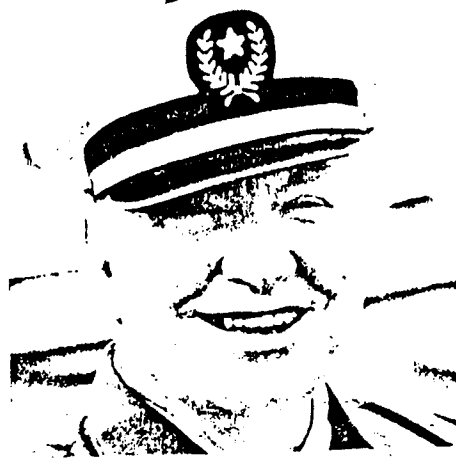
L. Ron Hubbard: the saviour stays silent

Now we know why they attack us - it is because we are against such psychiatric tortures as electric shock, insulin shock, lobotomy and transorbital leucotomy to name the main ones and because we might deprive them of business. And now you know why we attack them.