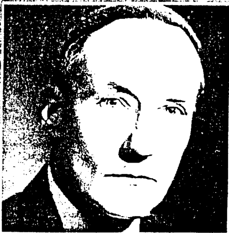
William Burroughs: he accused Scientology

We are trying to bring into confrontation two of the world's most revolutionary minds. World-famous author William Burroughs, in a recent Mayfair article, stirred up the controversial cult of Scientology by directly accusing its enigmatic leader, L. Ron Hubbard, with hiding tremendous psycho-therapeutic discoveries behind a neo-fascist organisation. Hubbard himself hasn't replied, but for the first time ever in a British publication, his wife Mary Sue Hubbard has come to his defence. This statement came direct from the Hubbard's yacht 'Apollo', currently on a cruise in the Aegean