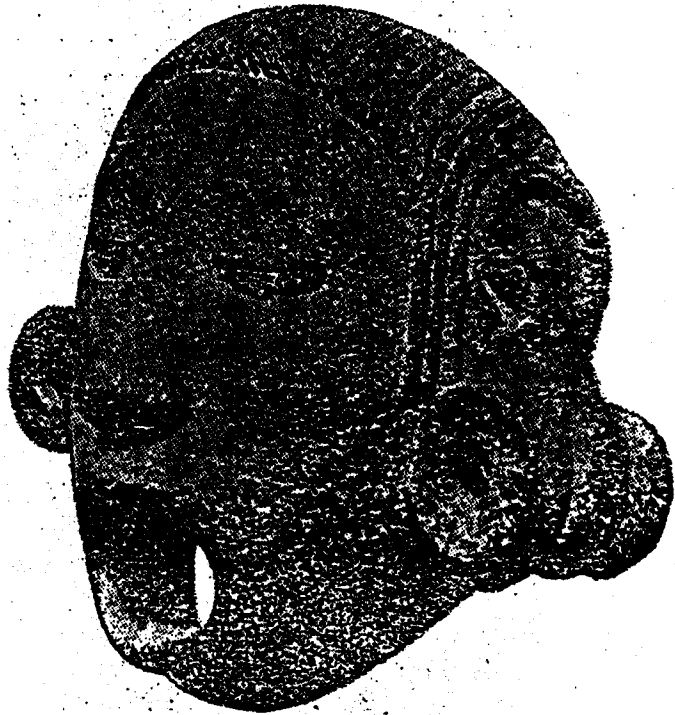
A symbolic skull — from the cover of Dr. Hubbard's book

(Have You Lived Before This Time? by L. Ron Hubbard, published by L. Ron Hubbard, by authority of L. Ron Hubbard, 24s.)