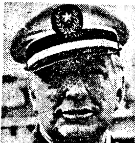
HUBBARD ... somewhere at sea.

Marischal Place, Edinburgh, said she was linked to an E meter—a "kind of lie detector"—as questions were fired at her by the staff at the organisation, Thistle Street.