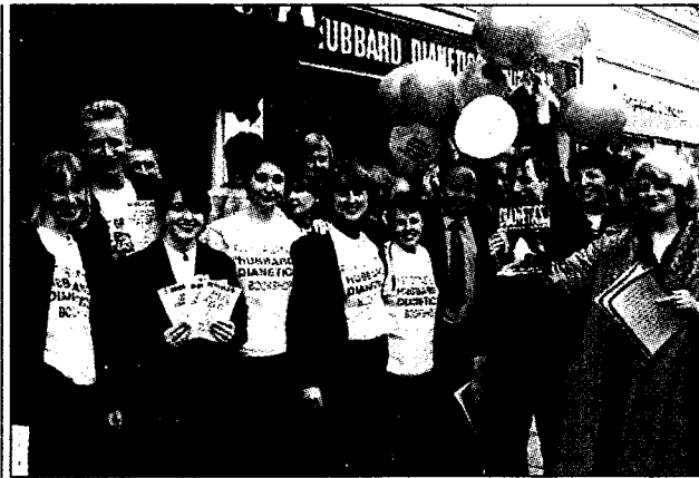
Scientologists celebrate the opening of the new Hubbard Dianetics bookshop in East Grinstead