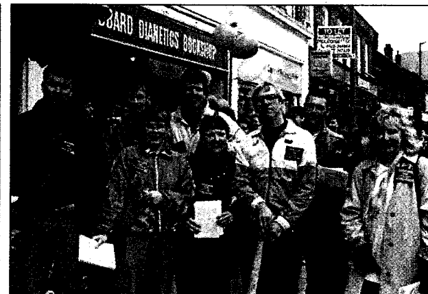
Protestors held a vigil outside the new bookshop and distributed leaflets in which they denounce Scientology