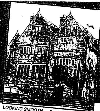
LOOKING SMOOTH... the imposing exterior